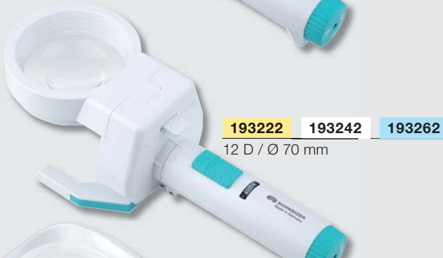
193222 193242 193262 12 D / Ø 70 mm