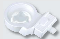
191102 Head MODULAR 20 D / Ø 55 mm