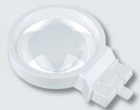
195102 Head MODULAR 6 D / Ø 100 mm