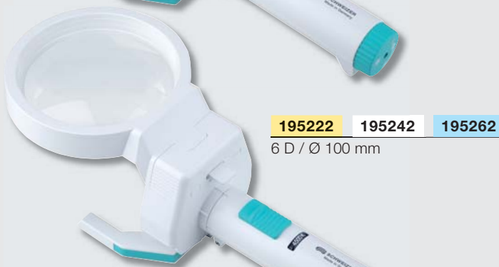
195222 195242 195262 6 D / Ø 100 mm