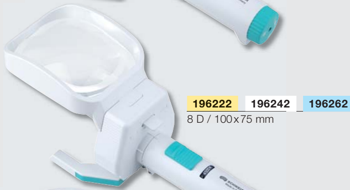
196222 196242 196262 8 D / 100x75 mm