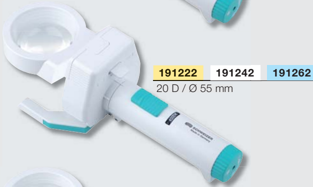
191222 191242 191262 20 D / Ø 55 mm