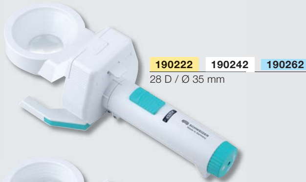
190222 190242 190262 28 D / Ø 35 mm

Light temperatures: 2700 K 4500 K 6000 K