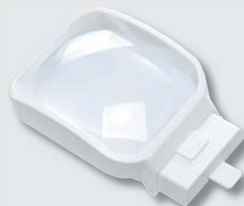
196102 Head MODULAR 8 D / 100x75 mm