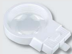
193102 Head MODULAR 12 D / Ø 70 mm