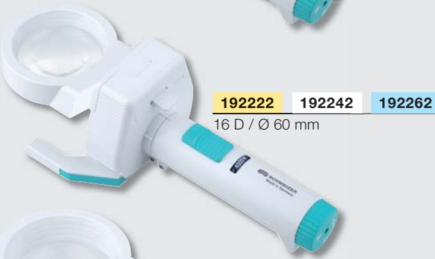
192222 192242 192262 16 D / Ø 60 mm