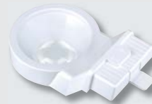
190102 Head MODULAR 28 D / Ø 35 mm

Easily interchangeable battery operated basic unit (handle incl. fixed tilting part) in different light temperatures. Tilting part inclinable in both directions for right-hand or left-hand use.