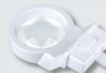
192102 Head MODULAR 16 D / Ø 60 mm